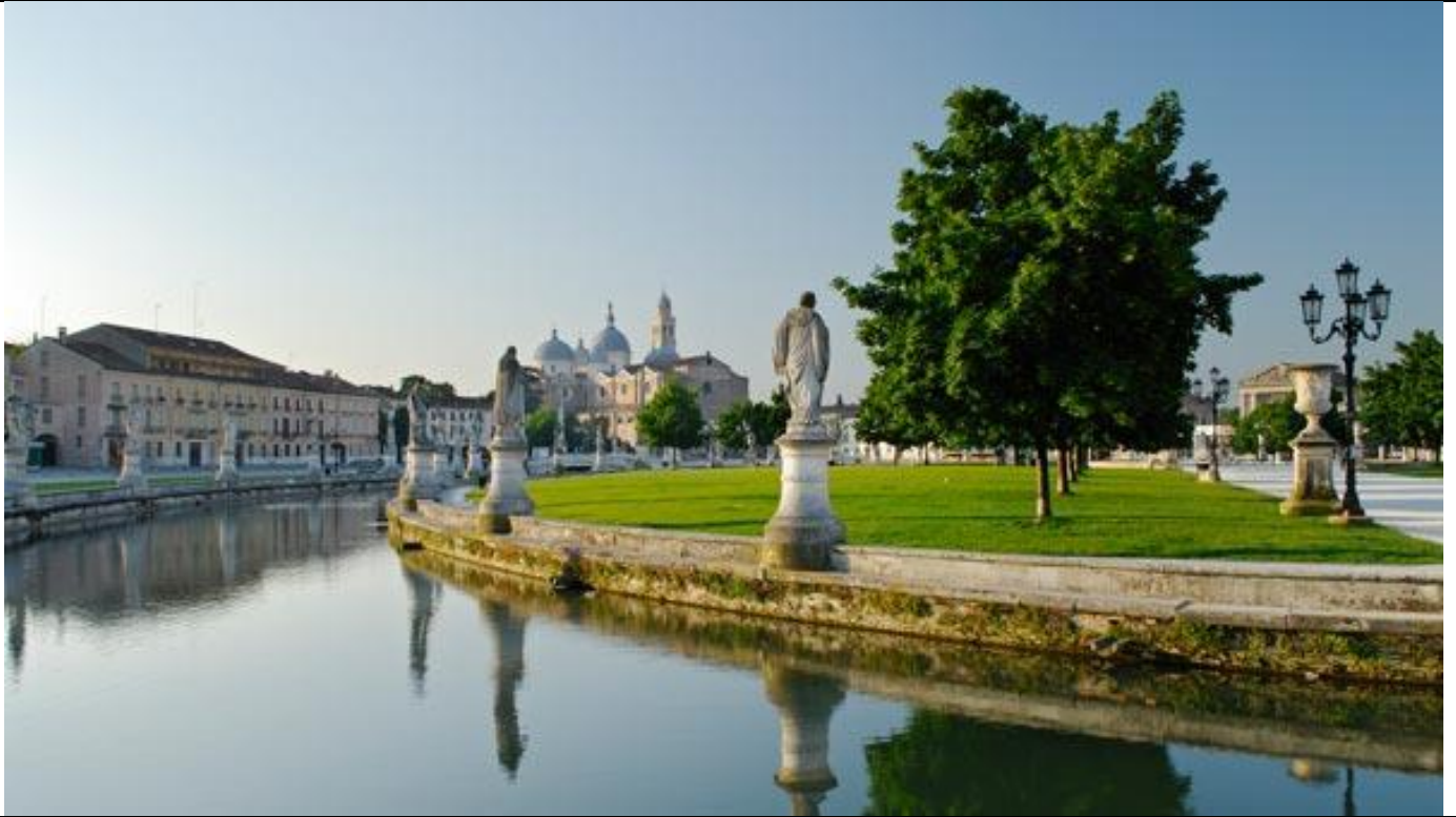
Padova – Prato della Valle (year 1550) – the second largest square in Europe (88.620 m 2 ), after Red Square of Moscow – Russia