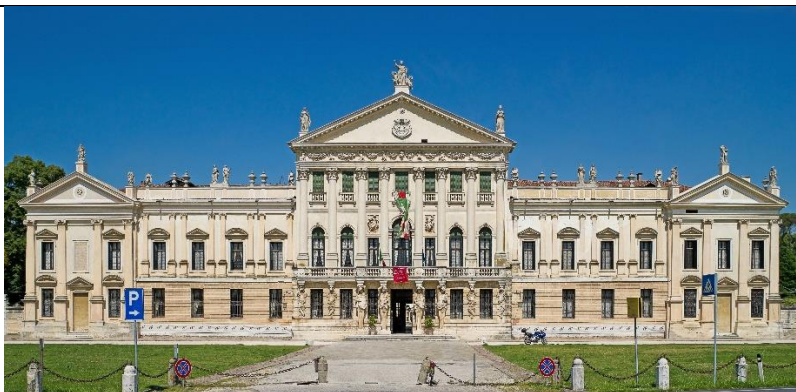
Villa Pisani – front

Open all year - Closed on monday - Free entrance first Sunday of month