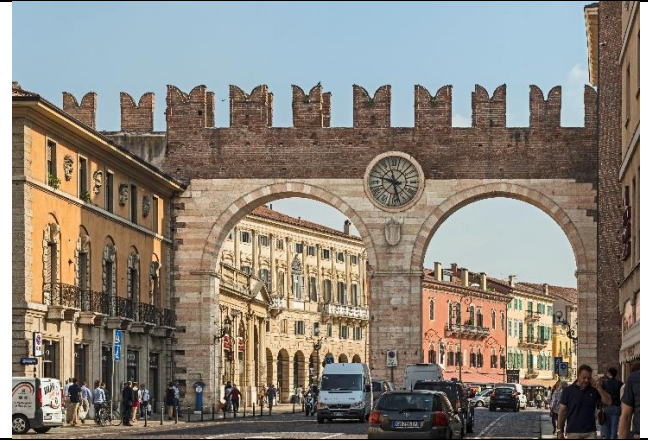
Verona – Porta Nuova + Corso Porta Nuova – Portoni della Bra