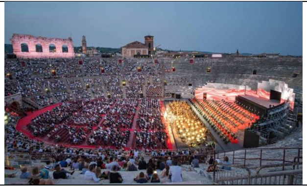
Verona – Arena by night – Opera Festival