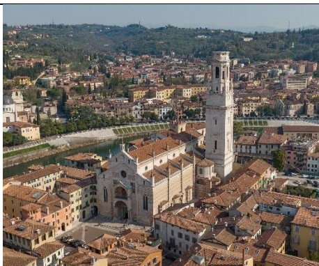
Piazza Vescovado – Cattedrale di Santa Maria Matricolare