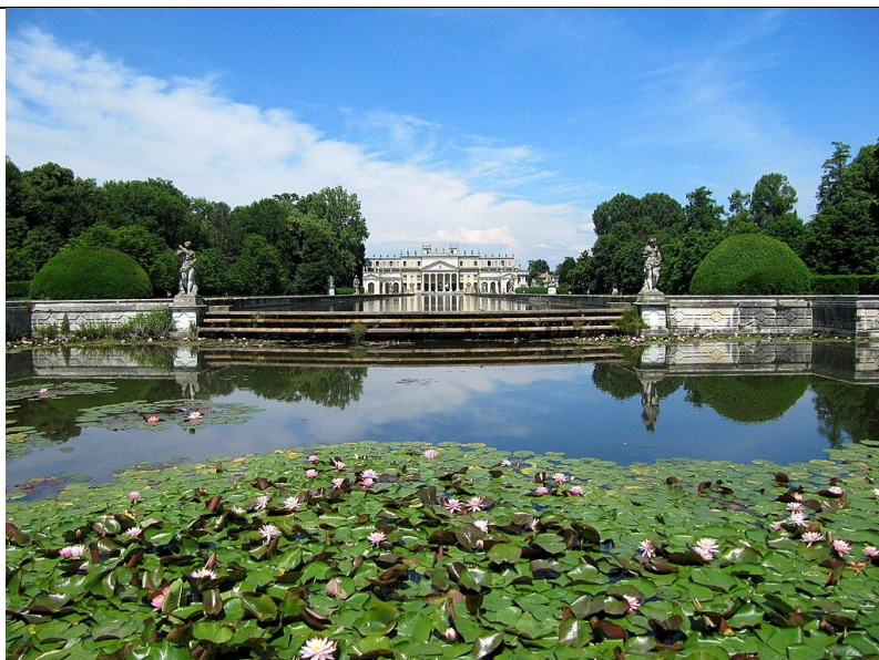
Villa Pisani – rear and garden