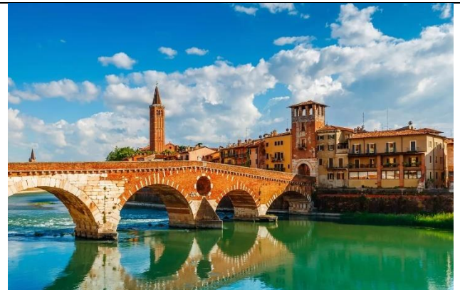
Verona – Piazza Mercato delle Erbe – Bridge over river Adige