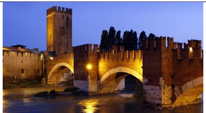
Verona – Corso Castelvecchio, 2 Castelvecchio