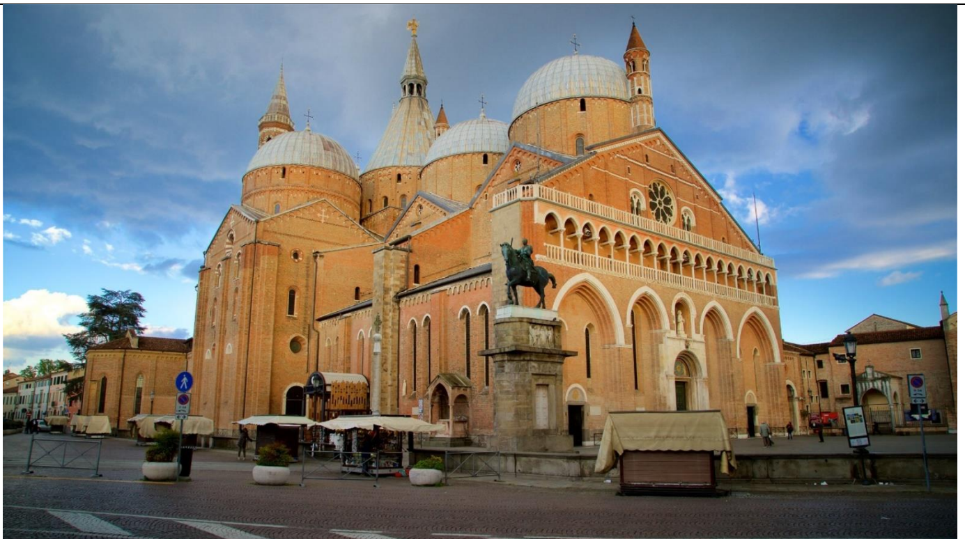
Padova – Piazza del Santo – Basilica di Sant'Antonio di Padova (1310)