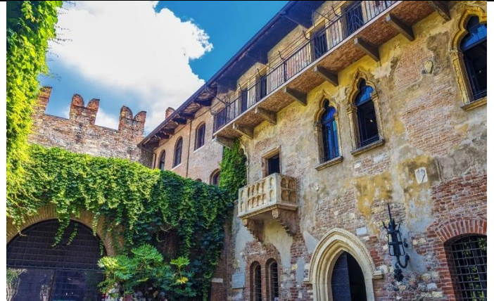
Verona – Via Cappello, 23 – Giulietta e Romeo – Juliet's house