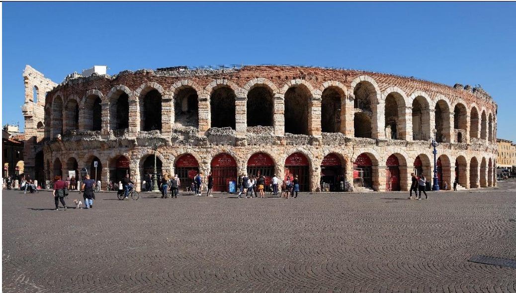
Verona – Piazza Bra – roman Arena (year 40 by Imperatore Augusto)