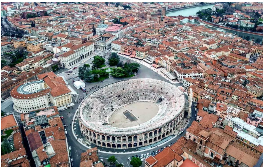
Verona – Arena